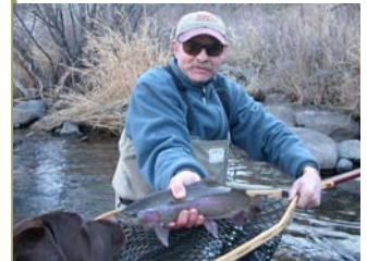
Fidget inspects a Yakima 'Bow