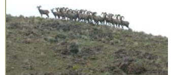
Bighorn Sheep on the ridge.