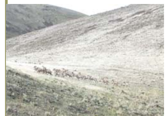
Sheep moving up the draw.