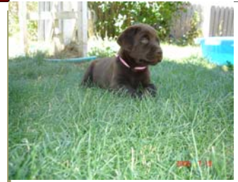
One of Fidget's New Puppies

the Clackacraft sales office. Call us for details.