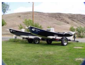
New '05 Boats for Sale

“The beauty of this landscape . . . can only truly be appreciated by being there in person”